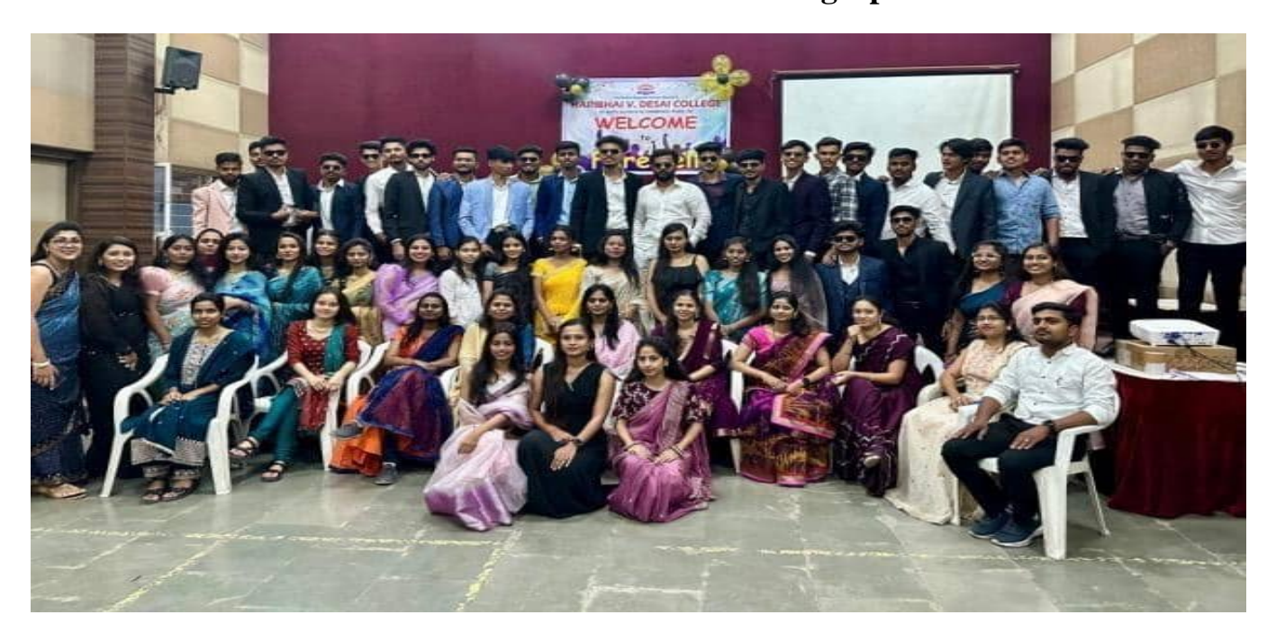
TYB.Sc.(CS) Students Class Photograph